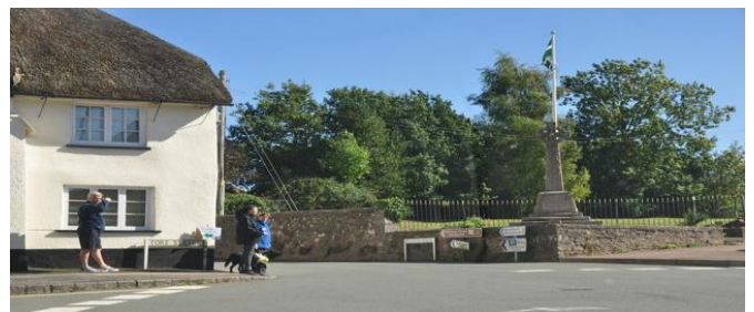
SILVERTON VILLAGE CENTRE