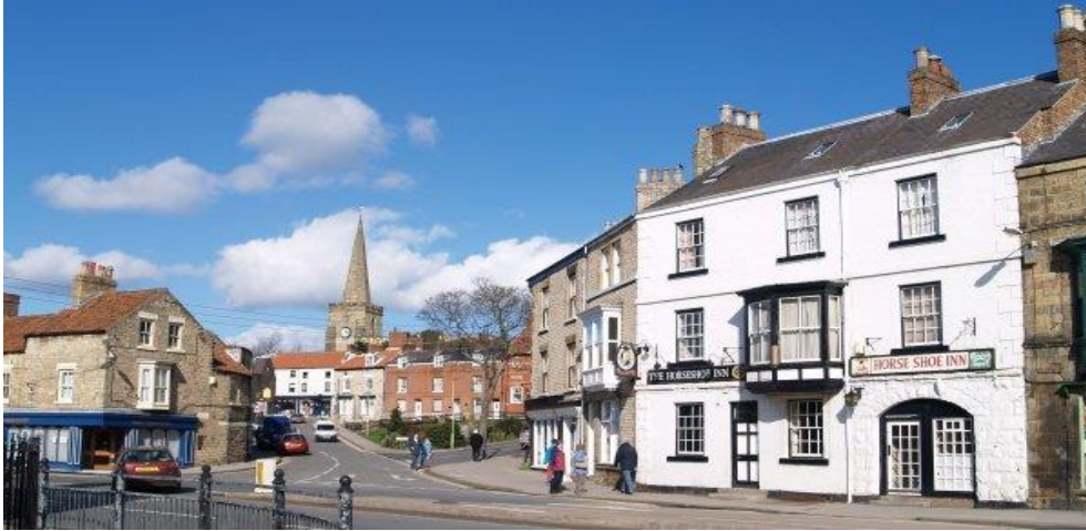
PICKERING TOWN CENTRE

I live in Ryedale and came under pressure from family members to try to get on the District Council to present the voice of local people. I have never had a taste for local politics until a significant issue raised its profile. Fracking at near-by Kirby Misperton is moving towards consideration for planning consent. A large area of Ryedale has licenses granted which could end up with up to 2000 wells being drilled over time. It remains speculation and guesswork but companies have been tasked with a responsibility to maximise their exploitation of the local resource. My reading around the subject increased in intensity and I found I was able to understand much of the science which merely increased my feelings of foreboding and concern for the health and well-being of the people of Ryedale. 30 years of my working life had gone to improving health as a local GP and I felt uneasy about exploiting a fossil fuel locally and in doing so risking the environment, water sources and particularly health.